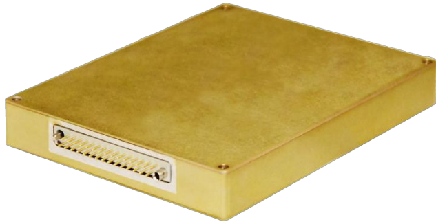
Low Voltage, Low Profile, Multi-Output (3 Outputs Standard) Power Supply Module (Up to 125W)